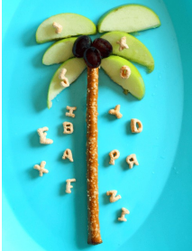
Chicka Chicka Boom Boom Snack

Find this activity at: https://iheartcraftythings.com/storytime-tuesday-chicka-chicka-boom.html